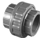
Part No. PVC 8810** Union With EPDM O-Ring Seal (FPT x FPT)