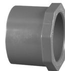
Part No. PVC 8107 Reducer Bushing (Flush Style) (SPG x S)