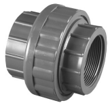
Part No. PVC 8800** Union With Viton® O-Ring Seal (FPT x FPT)