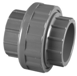
Part No. PVC 8700** Union With Viton® O-Ring Seal (SxS)