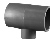
Part No. PVC 8400 Reducing Tee [SxSxS]