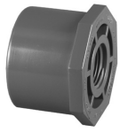
Part No. PVC 8108 Reducer Bushing (Flush Style) (SPG x FPT)