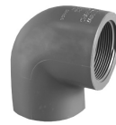
Part No. PVC 8301 90 Degree Elbow (S x FPT)