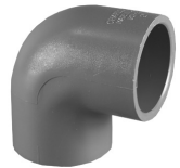
Part No. PVC 8300 90 Degree Elbow (S x S)