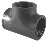
Part No. PVC 8402 Tee (FPT x FPT x FPT)