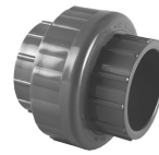
Part No. PVC 8710** Union With EPDM O-Ring Seal (SxS)