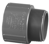
Part No. PVC 8109 Male Adapter (S x MPT)