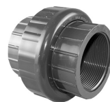
Part No. PVC 8830** Union With EPDM O-Ring Seal (Sx FPT)