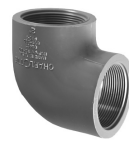
Part No. PVC 8302 90 Degree Elbow (FPT x FPT)