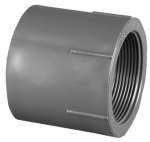
Part No. PVC 8101 Female Adapter (S x FPT)