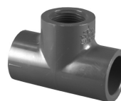
Part No. PVC 8401 Tee [SxSxFPT]